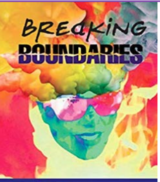
LGBTQ2 Writers on Coming Out and Into Canada

Breaking boundaries : LGBTQ2 writers on coming out and into Canada by Lori Shwydky